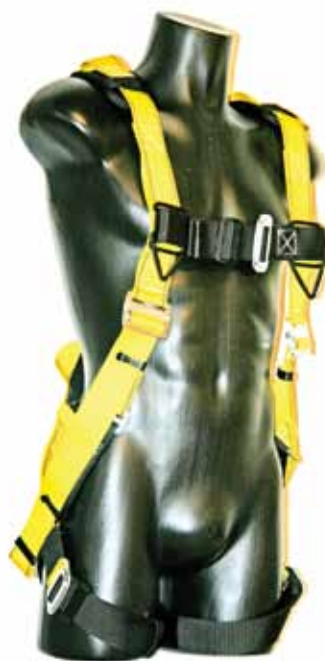
Seraph HUV (11160)