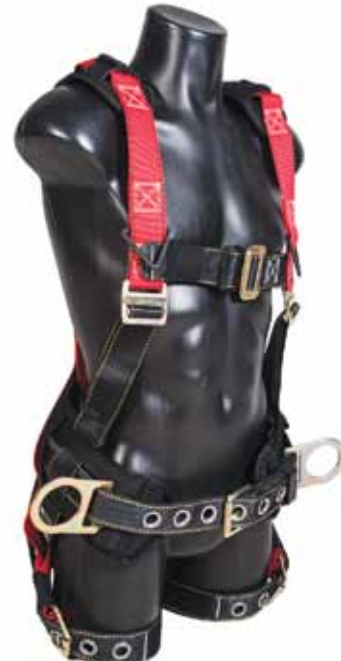
Seraph Construction (11173)